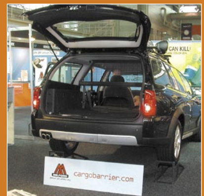
AAAA Trade Show 2005