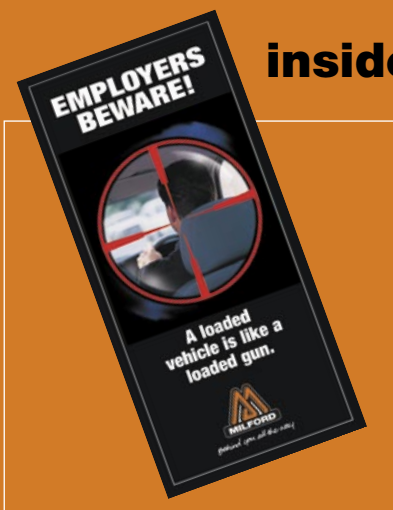
Employer risks escalate